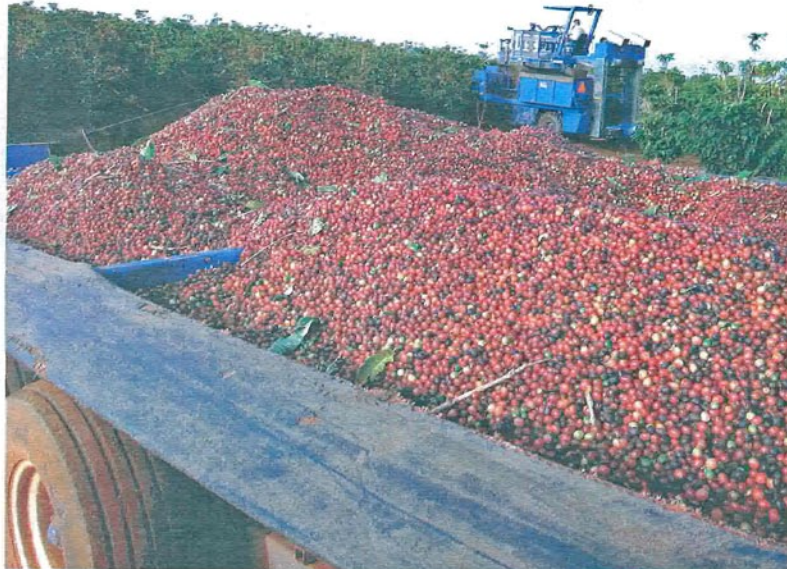
Residents and visitors are invited to drive up to MauiGrown Coffee to see its four coffee varieties — Typica, Red Catuai, Yellow Caturra and Maui Mokka — and take in the scenery.

Visit us on the web at www.lahainanews.com